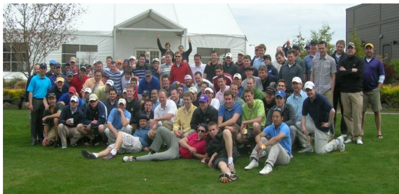
2008 Alpha Delta Cup Participants