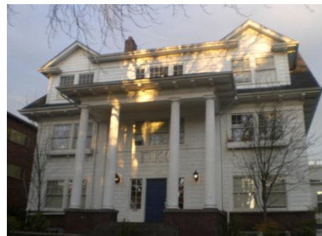
Our current chapter house, located on 17 th Ave N.E.

Alpha Delta Alumni – Although it has been a while since the newsletter has been published, we hope to bring you up to date with this edition. Its highlights include a statement from the current archon, some alumni updates, and information about upcoming alumni events. Enjoy.