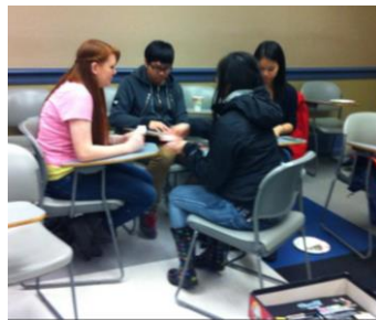
Lunar New Year Walkathon