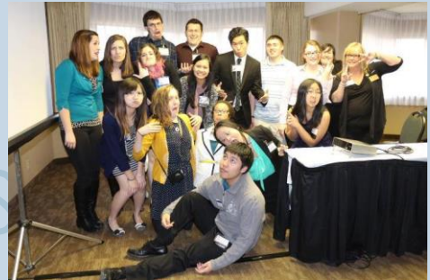
DISTRICT CONVENTION 2014